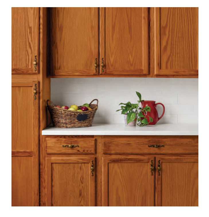
BEFORE Years of use and wear quickly age cabinet doors, and the current stain or paint color might have gone out of style.

Being skilled, knowledgeable and experienced in cabinet refinishing can be a huge competitive advantage. And transforming dated or worn-out cabinets can help make any space look completely new.