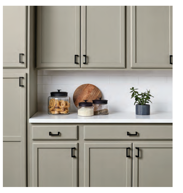
AFTER The refinished cabinets have a contemporary color that gives the kitchen a refreshed new look.